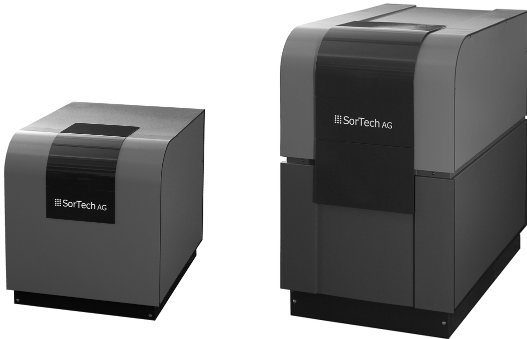
Figure 2: adsorption chiller ACS 08 and ACS 15 - Release 2009

In order to achieve high electrical COPs of the overall system, SorTech AG offers an integrated subsystem consisting of the chiller and a tailored hybrid re-cooler with variable speed EC fans, controlled by the chiller. This enables to drive the fans demand-oriented, leading to low overall electricity consumption. Furthermore, system integration and control is considerably simplified.